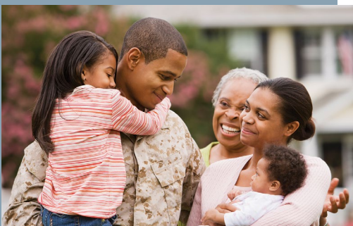
Military Assist Webinar