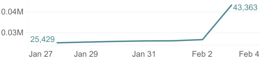
(2) Resolving Other Eligibility Issues