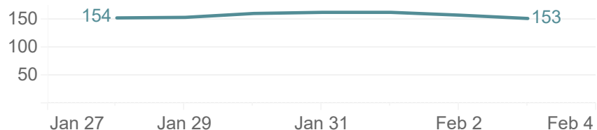
(1) Updating Previous Benefit Award