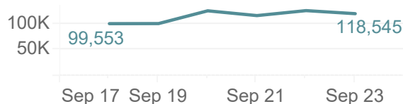
(4) Waiting for Claimant Certification