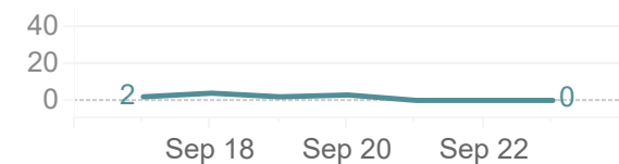
(1) Pending Application Processing