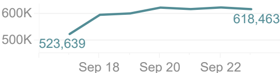
(5) Subtotal of 1-4