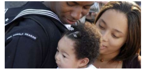
[Photograph of family members expressing support and/or affection]